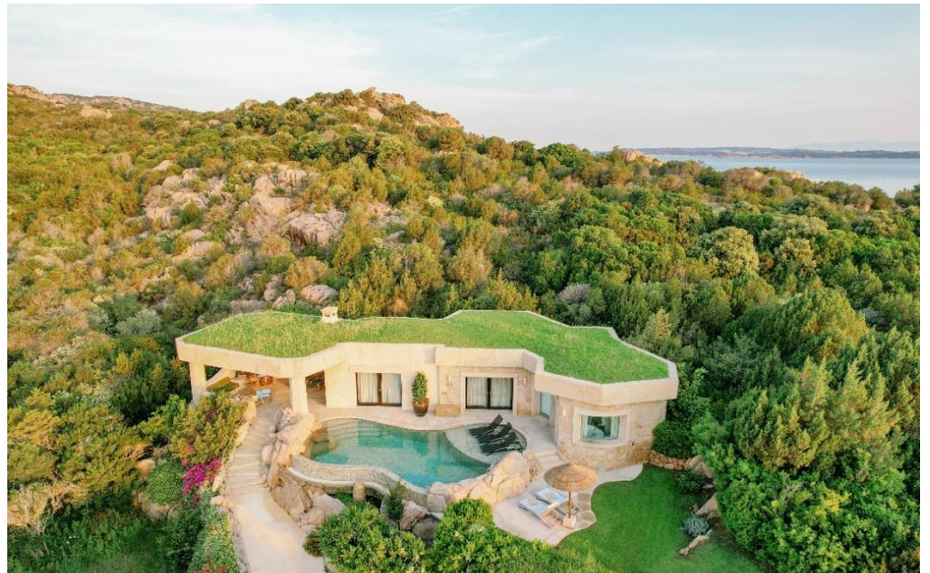
49 enchanting Sardinian-style rooms & suites